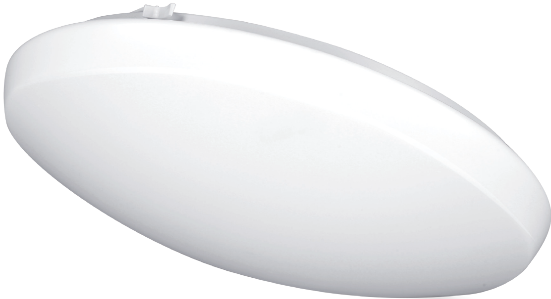
1015, 1016 & 1017 LED