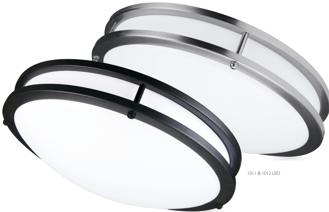
1011 & 1012 LED